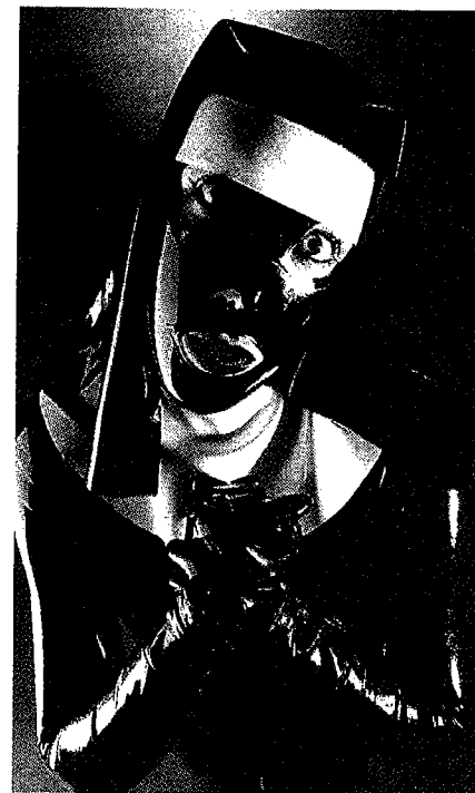
Rockstar of rubber: LovinLatex will be on hand at Diabolique Ball 2012.

Sat., Nov. 17, 9pm. $35-$100. Shampoo Nightclub, 417 N. Eighth St. 215.923.1398. phillyfetishball.com